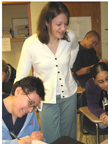
Hazleton Area School District

PIIC is committed to rigorous evaluation of mentoring and coaching in Pennsylvania, so that educators can learn how mentoring and coaching impacts classroom instruction and student engagement and achievement. Over the past four years, our research has confirmed considerable success among the students of teachers who have been coached, including: